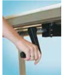
Quickly, easily adjust table surface heights from 30" - 42" or from 34" - 40"