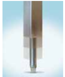
Available with either adjustable bullet feet or casters