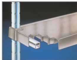
Steel Reinforced Shelf