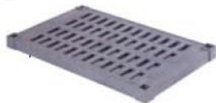
Plasteel® Vented Shelf PS1836V