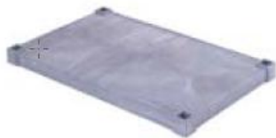
Plasteel® Solid Shelf PS1836S