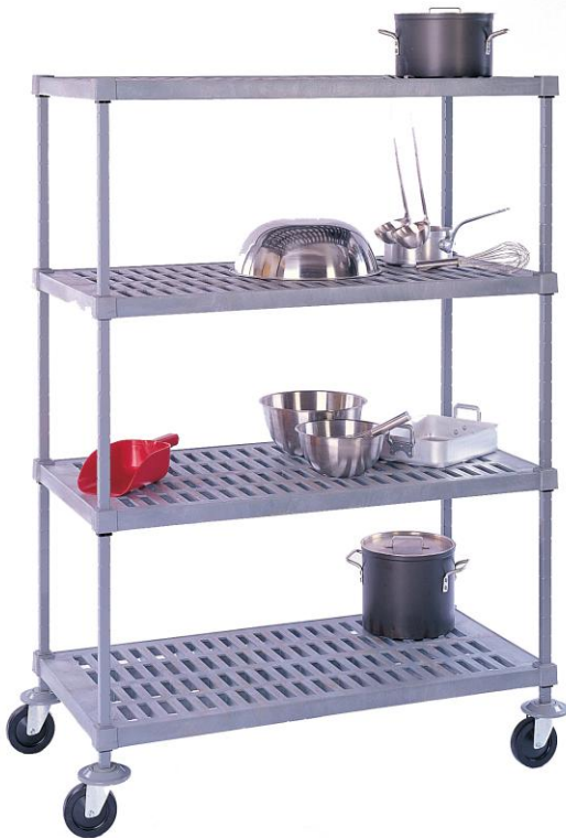
Plasteel® Mobile Unit