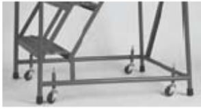
Spring Loaded Casters