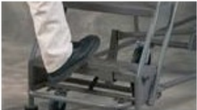
SAF-T Lock: Caster carriage retracts allowing metal reinforced rubber-tipped feet to grip floor. Step on U-Tube bar and ladder becomes mobile on easy-roll plastic wheels.